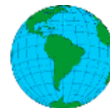
Association Latino Americana de Ostomizados (South American Ostomy Association)