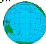
South Pacific Ostomy Association