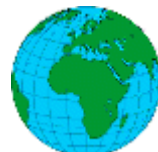
No Region Currently