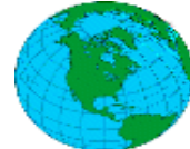
North and Central America and Caribbean Ostomy Association