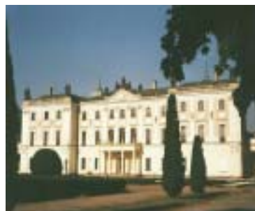
Bialystok_1: The Branicki palace in Bialystok.

In these few days I only reassured myself that the Polish ostomates made in the past 15 years a good deal of useful work and built an organisation which is capable of taking care of ostomates and asserting their rights.